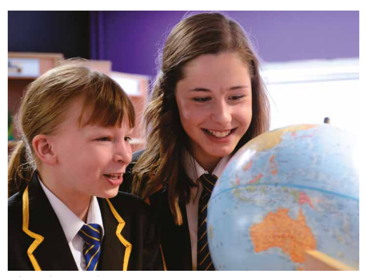
Students at Ipsley CE RSA Academy

The RSA's mission is to find innovative practical solutions to social problems. We do this through hands-on projects, research and our 27,000 Fellows around the world.